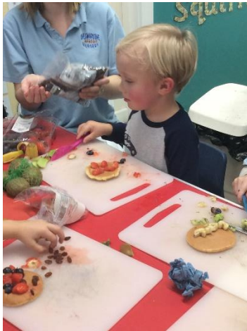
Butterfly Pancakes from the 'Monkey Puzzle' story

We have also done lots of 'food activities'.