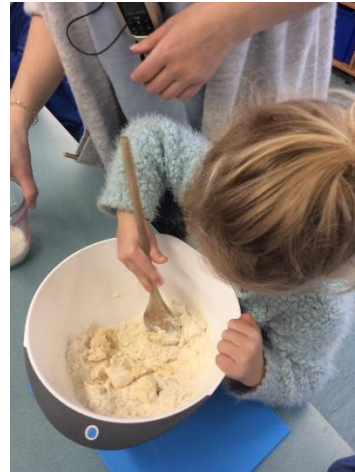
Making biscuits with Class One