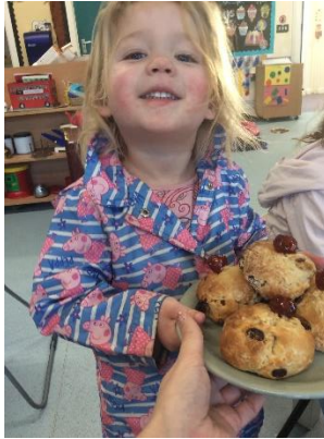
We even made our own 'Five Currant Buns'

This month we have been participating in World Nursery Rhyme Week. We learnt and practised a song every day for five days! Songs included 'Five Currant Buns', 'Humpty Dumpty' and a 'Sailor Went to Sea, Sea, Sea...!'