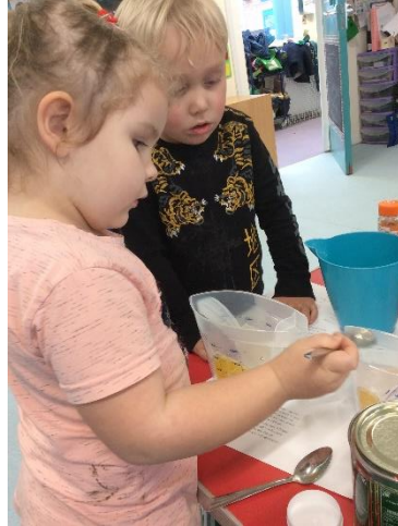
Making Gingerbread Men