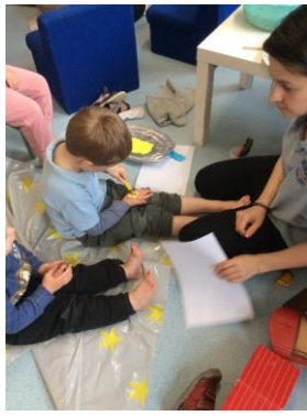
Painting our feet for some gifts.

We also joined in with School's Crazy Egg Race.