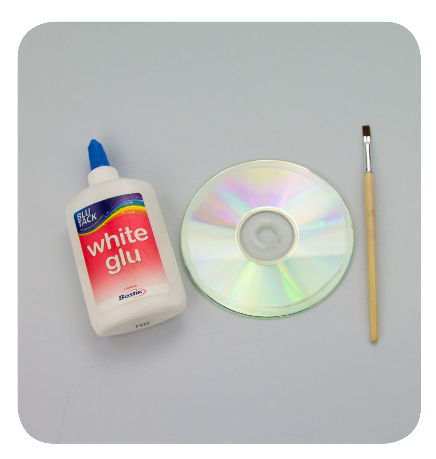
Step 1. First, clean the shiny side of the CD. Then, paint some lines and blobs of PVA glue onto the shiny side of the CD.