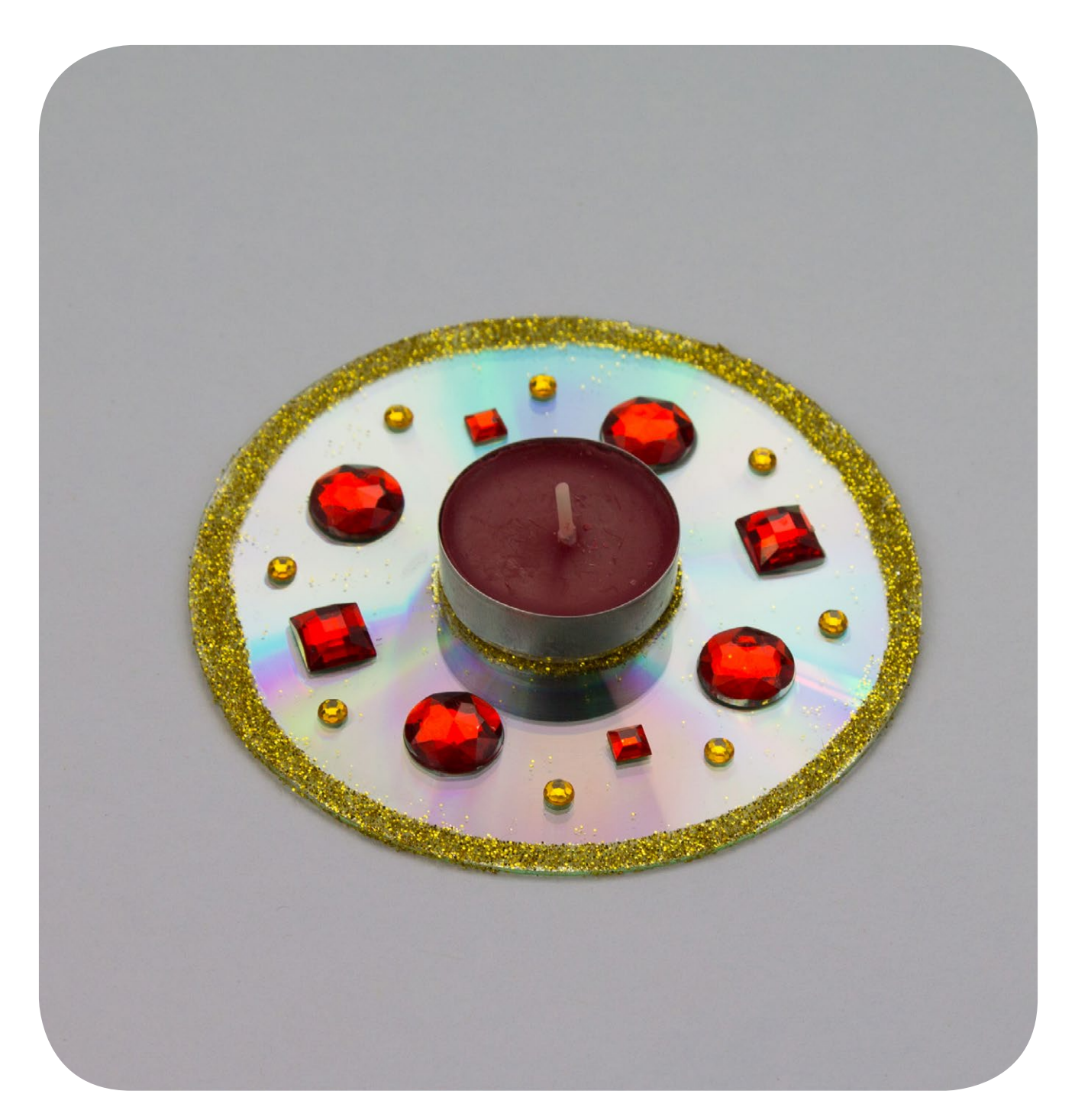
Step 4. Place a tealight or diva lamp in the middle of the CD where the hole is and ask an adult to light it! Battery-powered tea lights may be more suitable, depending on the age of the child(ren).