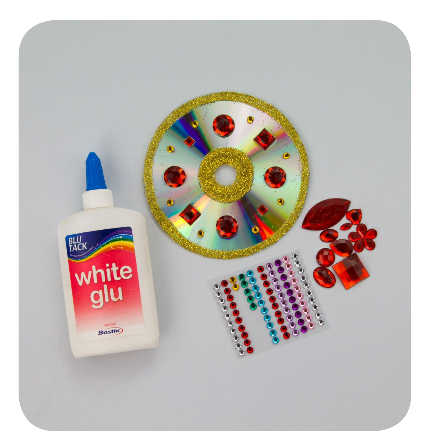
Step 3. Then, dab some glue onto the CD and stick on some sequins or jewels. Allow to dry.