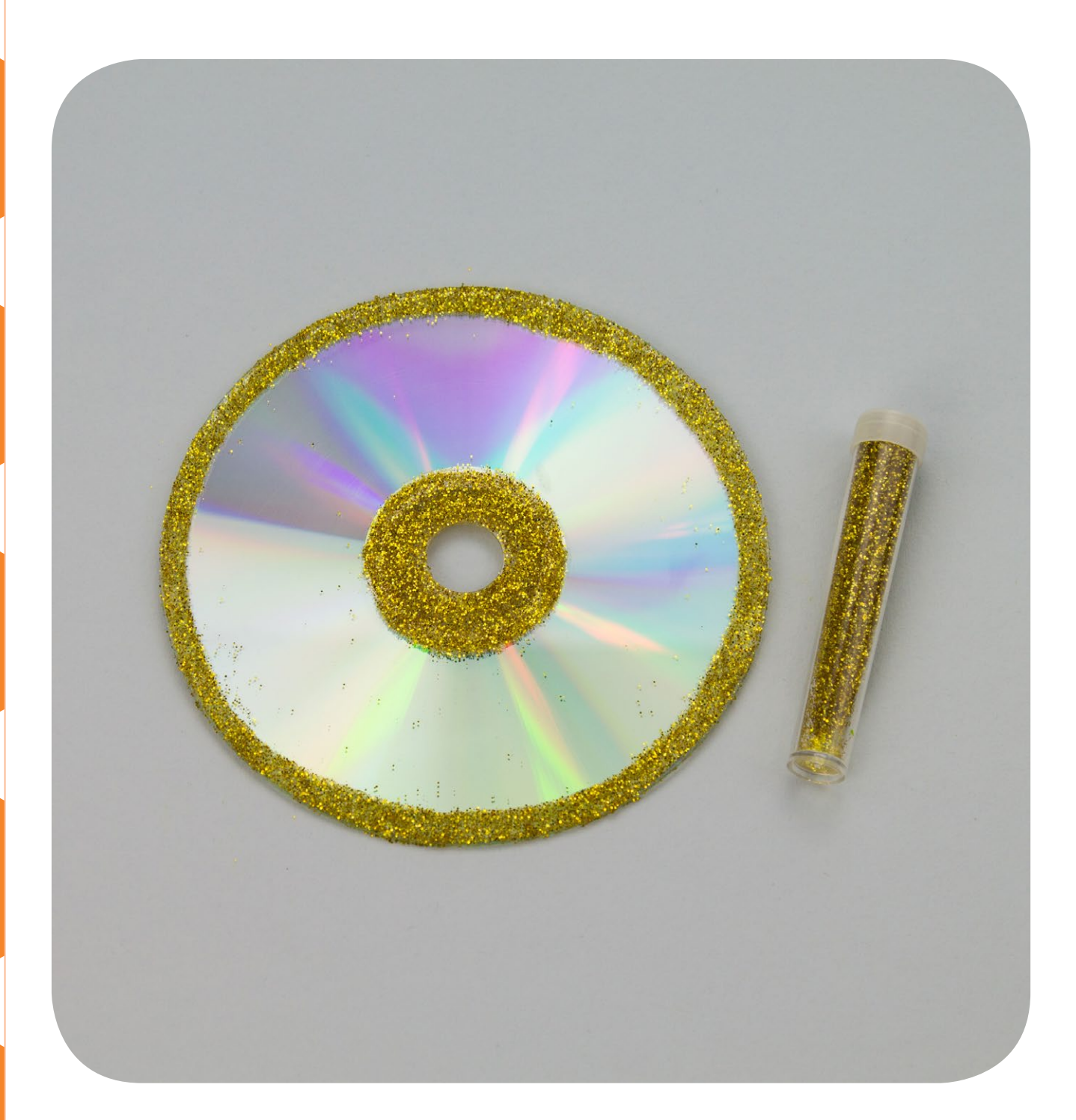
Step 2. Next, sprinkle some glitter onto the wet glue.